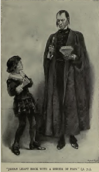
"JEHAN LEAPT BACK WITH A SHRIEK OF PAIN" (p. 74).