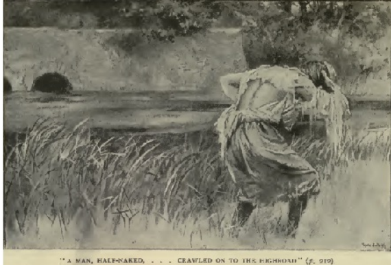
"A MAN, HALF-NAKED, . . . CRAWLED ON TO THE HIGHROAD" (p. 212)

"A MAN HALF-NAKED ... CRAWLED ON TO THE HIGHROAD" (p. 212).