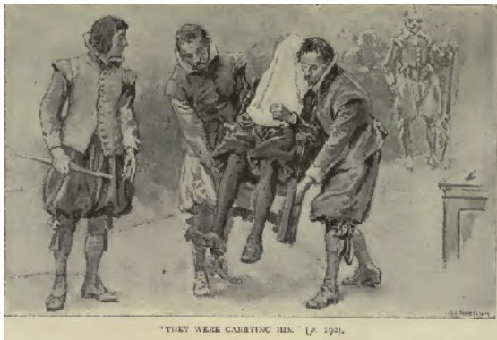
"THEY WERE CARRYING HIM." (p. 192).

What did it mean? She began to tremble, gazing at him wildly, expecting she knew not what. And he did not move.