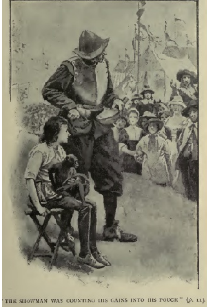
"THE SHOWMAN WAS COUNTING HIS GAINS INTO HIS POUCH" (p. 11).