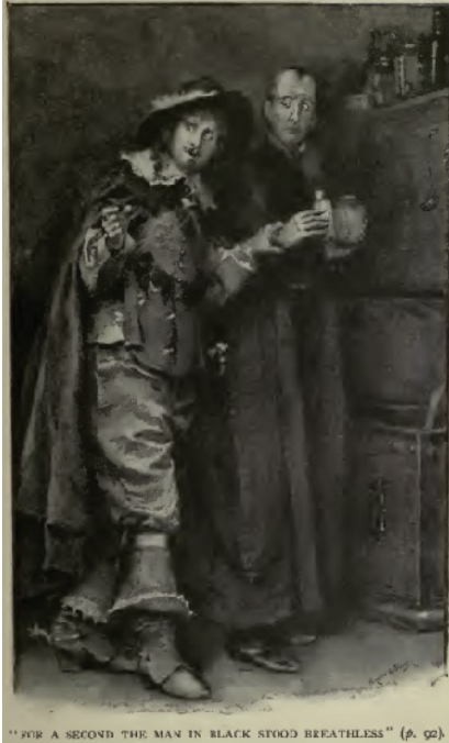
"FOR A SECOND THE MAN IN BLACK STOOD BREATHLESS" (p. 92).