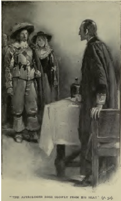
"THE ASTROLOGER ROSE SLOWLY FROM HIS SEAT" (p. 52).